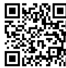
Image may differ from the actual product